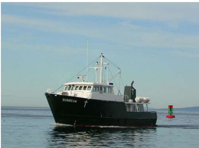
Sunbeam entering Matinicus harbor August, 2007

The mission: provide for the physical, healthcare, spiritual and economic needs of Maine’s island and remote coastal communities. The method: the 74’ vessel “Sunbeam” operated by the 102 year-old Maine Seacoast Mission. I’d heard of Sunbeam and her seagoing good works. As she rounded the breakwater inbound at Matinicus Island in the light of late August afternoon, I got my first chance to see her underway, making her rounds.